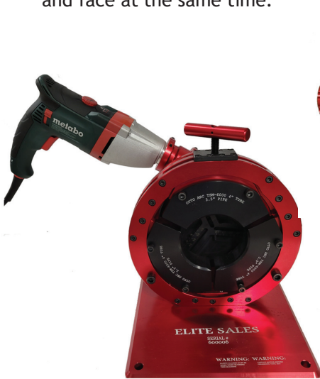
Front View with Motor

Our TSM-6000 Facing Machine was designed for easy use and light weight for its size. It comes with a bench mount stand, but can be lifted off easily for rack storage. This machine is also designed with two spring loaded lower collets, which helps realign round tubing when tightening. The TSM-6000 is primarily for facing tubing and pipe, but it can also bevel and face at the same time.