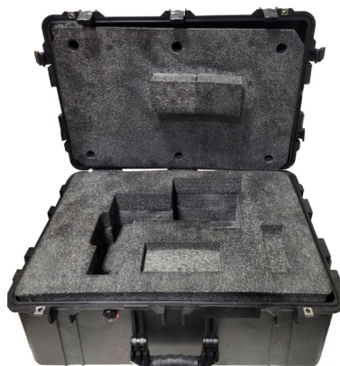
Optional: Heavy Duty Case Available for Purchase