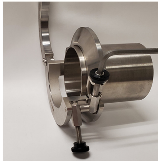
Pictured: Tack Clamp open with allen wrench for precise alignment.